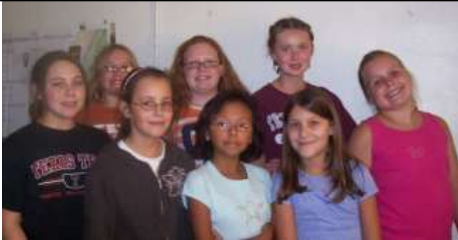
Methodist Youth Group

The UMW membership voted to combine the morning and evening groups into one Unit starting in 2010.